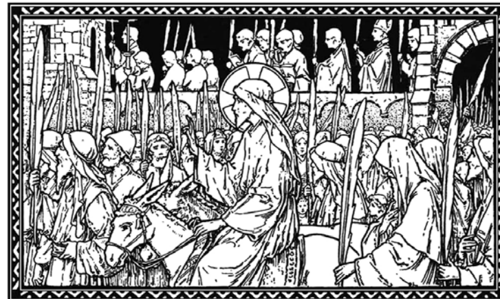
On Palm Sunday is reproduced the triumphal procession which accompanied our Lord when He entered Jerusalem.